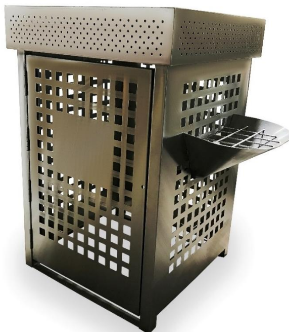
Body shown without internal Hot Box

For the disposal of hot charcoal bricks in parks and public venues.