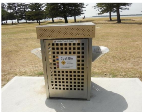
Shown with client's custom signage option

Also available in this range: EM226 with double chute